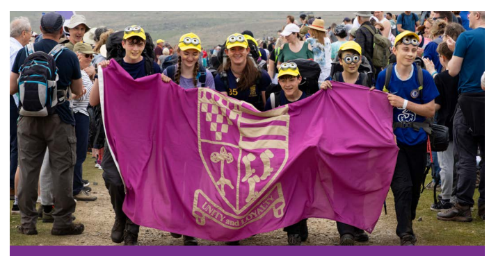
Ten Tors & Duke of Edinburgh Award