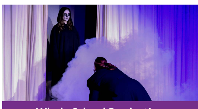
Whole School Production