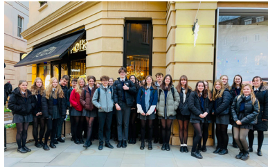
Perfect trip to Bath Christmas Market.

From Christmas Markets to German Baking, Christmas Jumper Day to Carolling, we've enjoyed many seasonal activities at Sheldon to welcome the festive season!