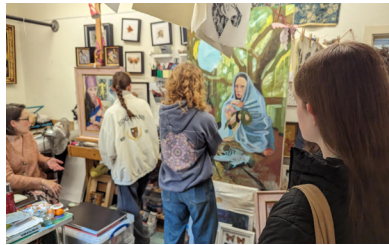
Art students visiting the Pound Arts Centre, Corsham