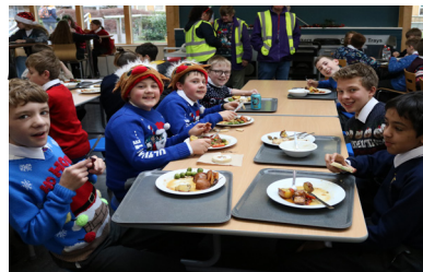
Christmas Lunch in the Refectory