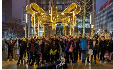
Year 7 take a MFL trip to the Birmingham Christmas Market