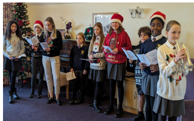
Year 7 Carolling at Fairways Care home