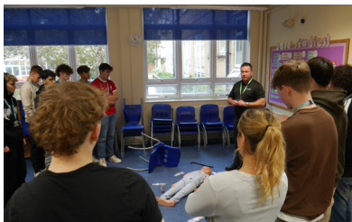
Criminology students get expert training during Crime Scene Day

We also welcomed visitors from the Solomon Theatre Company, Zakon Consultancy and the Flying Start Challenge .