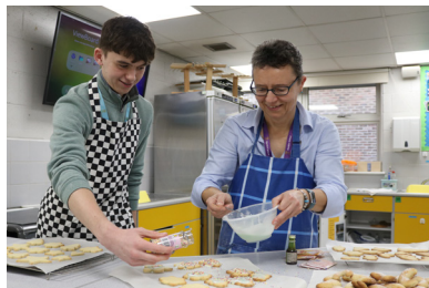
A-Level German Baking Day