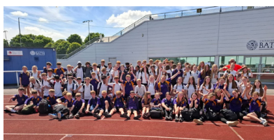
Y10 Girls Rounders 3rd Place in Wiltshire Games