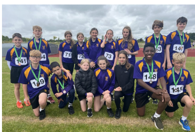
Y7 Boys Football County Cup Champions

These are just some of the highlights of our very busy sporting fixtures.