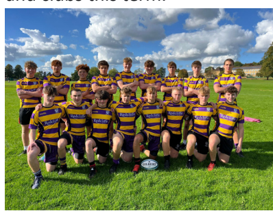
Sixth Form Rugby

Thanks to all the students who have participated in our teams and clubs this term.