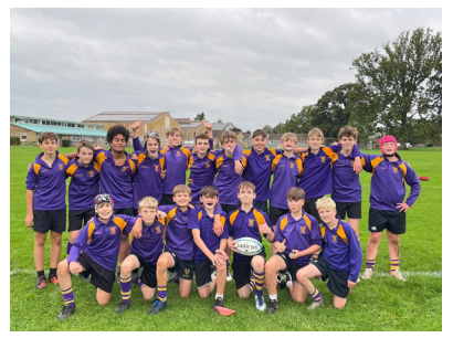
Year 9 Rugby