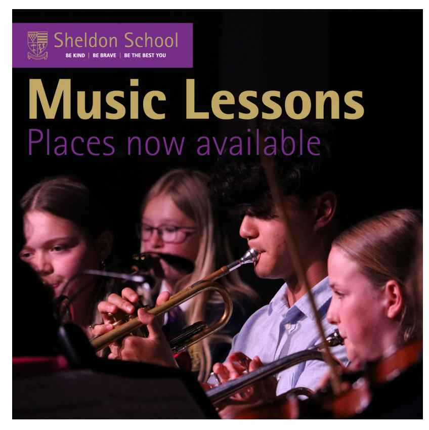
Click here to find out more