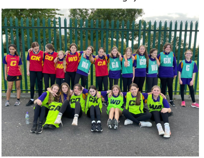
Year 8 Netball