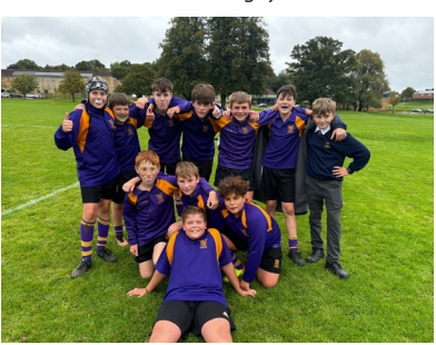
Year 8 Rugby