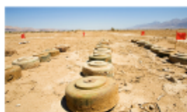
War's Toxic Legacy Professor Ian Mudway Tue, 14 Oct 2025 • Watch Online • In-person tickets sold out