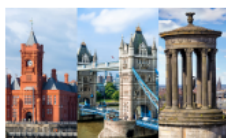
'Is it in Pevsner?': A Short History of the 'Buildings of ...' Series